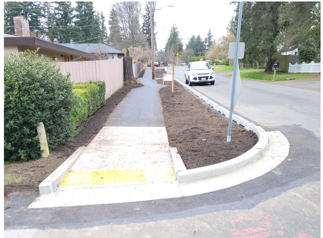
Walkway improvement on Ashworth Ave N for Ingraham High School