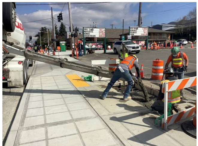
15th Ave S and S Columbian Way crossing improvement for Mercer Middle School