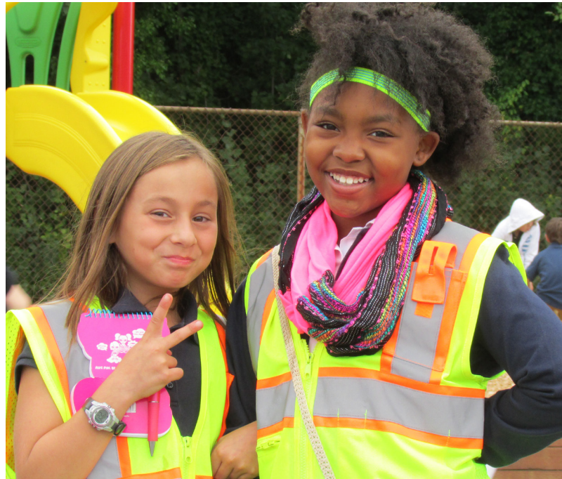
Student patrol funded by Safe Routes to School

Throughout 2020 and into 2021, staff across SDOT have engaged in conversations around the role of enforcement and policing in transportation. Using a racial equity toolkit framework and led by our Vision Zero team, SDOT is examining the traditional engineering, education, and enforcement approach we've relied on. This provides us with an opportunity to understand how this approach is or isn't advancing Seattle's Vision Zero and Race and Social Justice initiatives. Importantly, it provides an opportunity to adjust the approach to actively