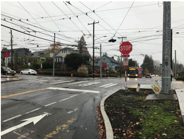
Crossing improvement at 31st Ave S and S McClellan St for Franklin High School