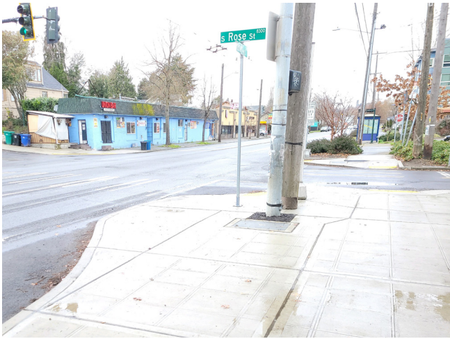
Crossing improvement at Rainier Ave S and S Rose St for Rainier Beach High School

Between September 2020 and August 2021, we completed engineering projects for 9 high-priority schools. Numbers reference the map of all the school engineering projects.