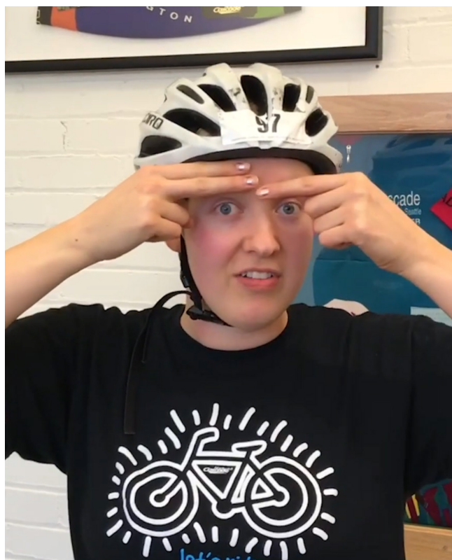
Helmet Safety video for online learning at home

In addition to the online videos, Cascade Bicycle Club also provided in-person direct youth engagement through the Major Taylor program. They developed a relationship with Seattle Parks and Recreation and offered COVID-19 safe youth bike rides in the fall of 2020 and spring of 2021 through the Meadowbrook Teen Hub, Southshore Teen Hub, Magnuson Park Teen Hub, and also through Eckstein Middle School.