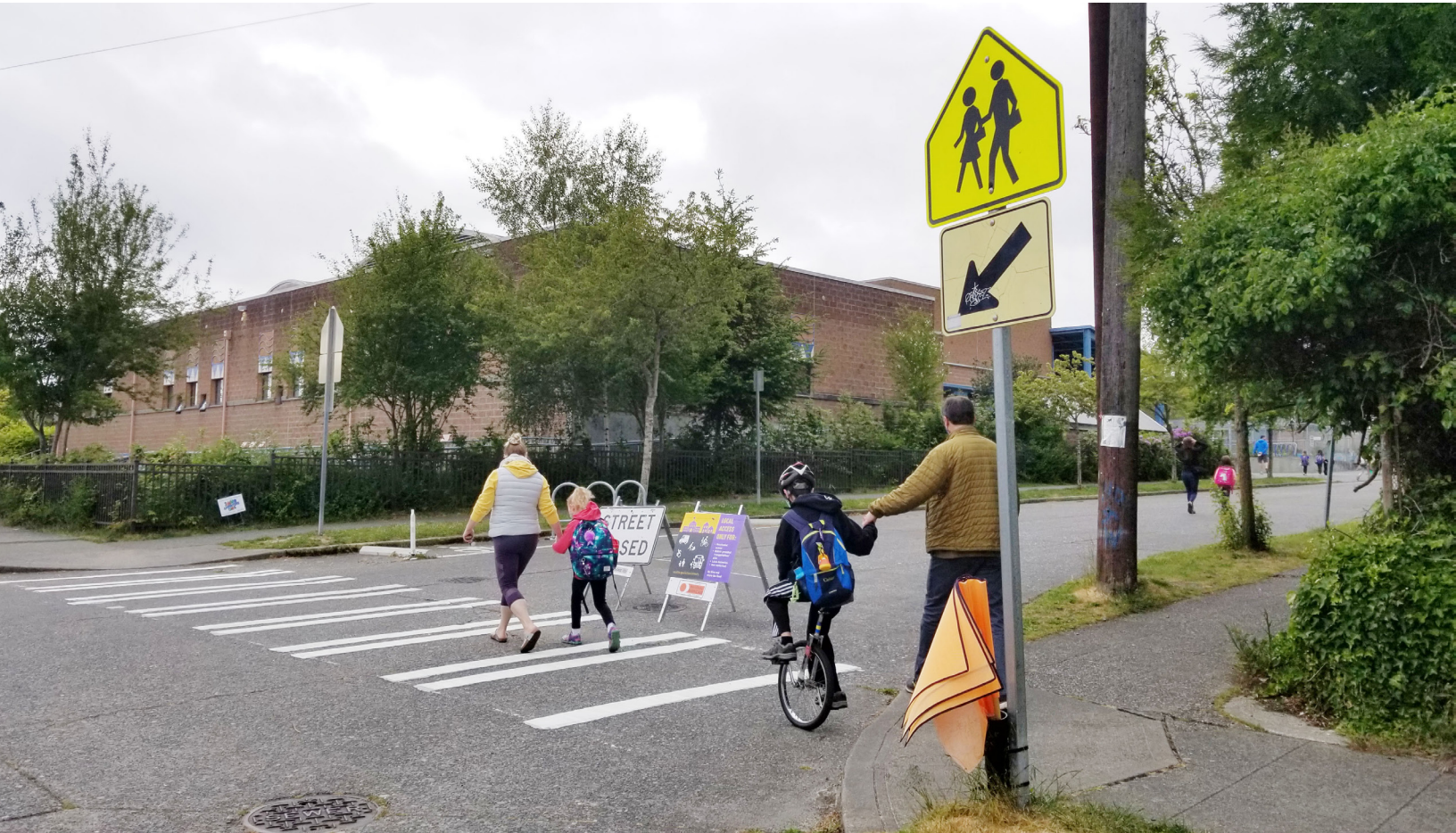
School Streets at Whittier Elementary School

When schools returned to in-person learning in the spring of 2021, we launched a new School Streets program to provide space for social distancing and improve safety, air quality, and traffic circulation around schools. Nine schools participated in this opt-in program that shuts down one or two blocks directly adjacent to the school to through traffic and parents and opens them up to families walking, biking, and rolling. We plan to continue this program into the future.